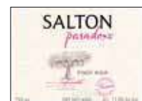
Paradoxo Pinot Noir 2013 #81811 | Six Pack | $72

Moscato blended with a small amount of Gewurztraminer and Malvasia. A combination of expressive and pleasant aromas of flowers (rose, geranium, carnation, jasmine) and fruit (peach, pineapple, apricot, banana).