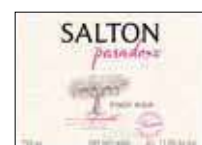
Paradoxo Pinot Noir 2013 #81811 | Six Pack | $72

Moscato blended with a small amount of Gewurztraminer and Malvasia. A combination of expressive and pleasant aromas of flowers (rose, geranium, carnation, jasmine) and fruit (peach, pineapple, apricot, banana).