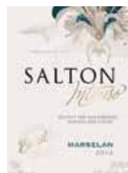
Intenso Marselan 2012 #81546 | Six Pack | $68

Intense purple color with aromas of berries, plums, mushroom, black pepper and other spices. Its tannins are remarkable with good permanence of flavors.